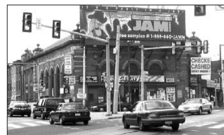
Lancaster Avenue before and after (an artist's rendering).