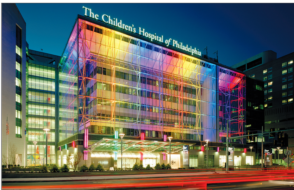
The $55 million facade of the West Philadelphia hospital was completed in November.

More space needed for researchers, patient care